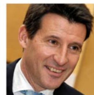
Boris Johnson Mayor of London

I'm delighted to have the opportunity to recognise the role of the British Bangladeshi community in the London 2012 Olympic and Paralympic Games.