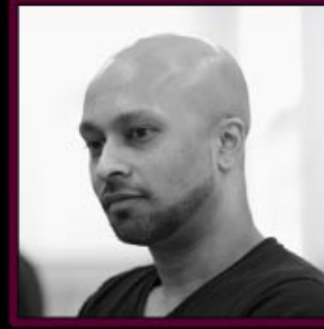
Akram Khan - choreographer/performer Olympic Games opening ceremony