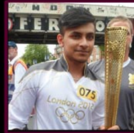
Nahimul Islam - Young Mayor of Tower Hamlets